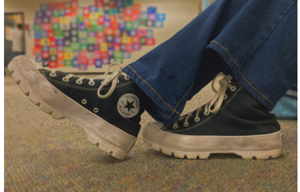
Gina Zorilla (12th grader) rocks chunky Converse

Flannel attire has been around for nearly two centuries now. They're considered both trendy and versatile, easily adaptable to any outfit choice. Flannel throw-ons are both comfortable and timeless. A significant number of students have been sporting plaid flannel jackets around campus, whether neat and buttoned up, or worn over a shirt. Flannel wear is a sight that's been around seemingly forever, but it never seems to get old.