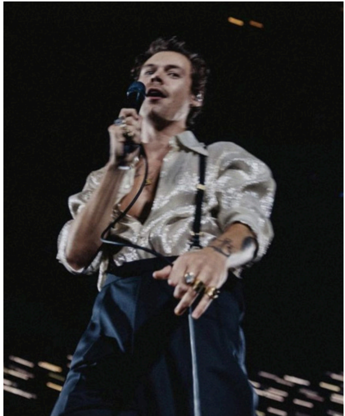
Harry Styles thrills fans at a recent concert

The song “Fine Line,” a fan favorite, has been featured all over social media as audience members share their videos of Styles’ note change during this transcendent song. Styles has also received elevated reactions from adding “What Makes You Beautiful,” by One Direction, along with “To Be So Lonely” to his setlist.