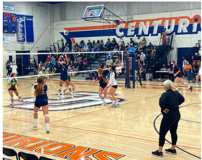
Girl's Volleyball defeats Kennedy on October 5, 2021.