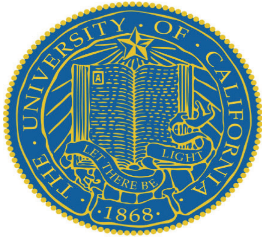
The application window for UCs started on November 1, 2023.