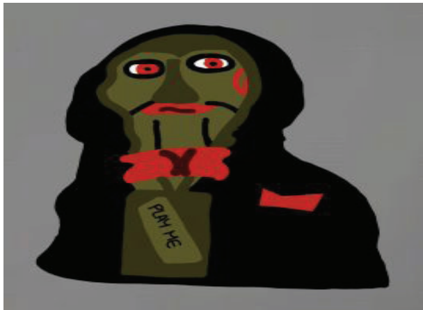
Jigsaw's puppet, Billy was used to relay a message to the players of his game.

The horror franchise, "Saw" released another gruesome film, "Saw X" to theaters in September 2023.