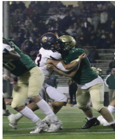
Varsity players butting heads during the semi-finals.