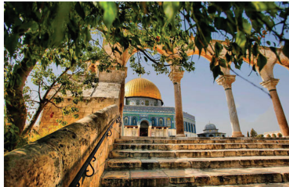
AL-AQSA MOSQUE Also known as the Al-Haram ash-Sharif. This mosque is the third holiest shrine for Muslims. Excerpt from Palestines Ministry of Tourism & Antiquities.

With many people calling for a ceasefire, the UN voted in October 2023, a total of 120 countries voted in favor of the resolution, 14 countries voted against including Israel and the United States, while 45 others abstained. And like Malcolm X once said: “If you’re not careful, the newspapers will have you hating the people who are being oppressed, and loving the people who are doing the oppressing.”