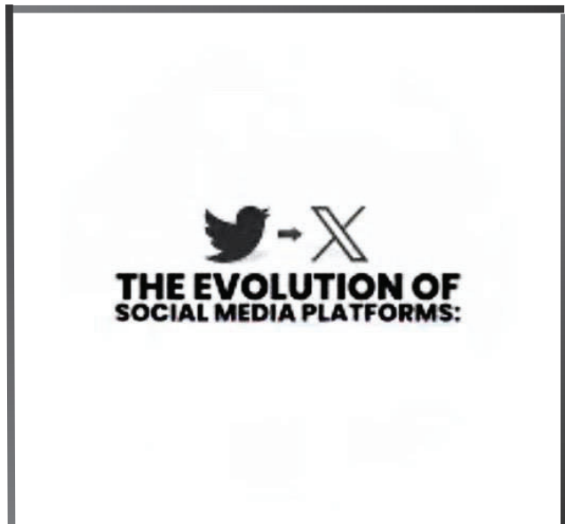
Social Media Continues to Change Rapidly

fan of the old or eager to explore the new, one thing is certain: social media will always be dynamic.