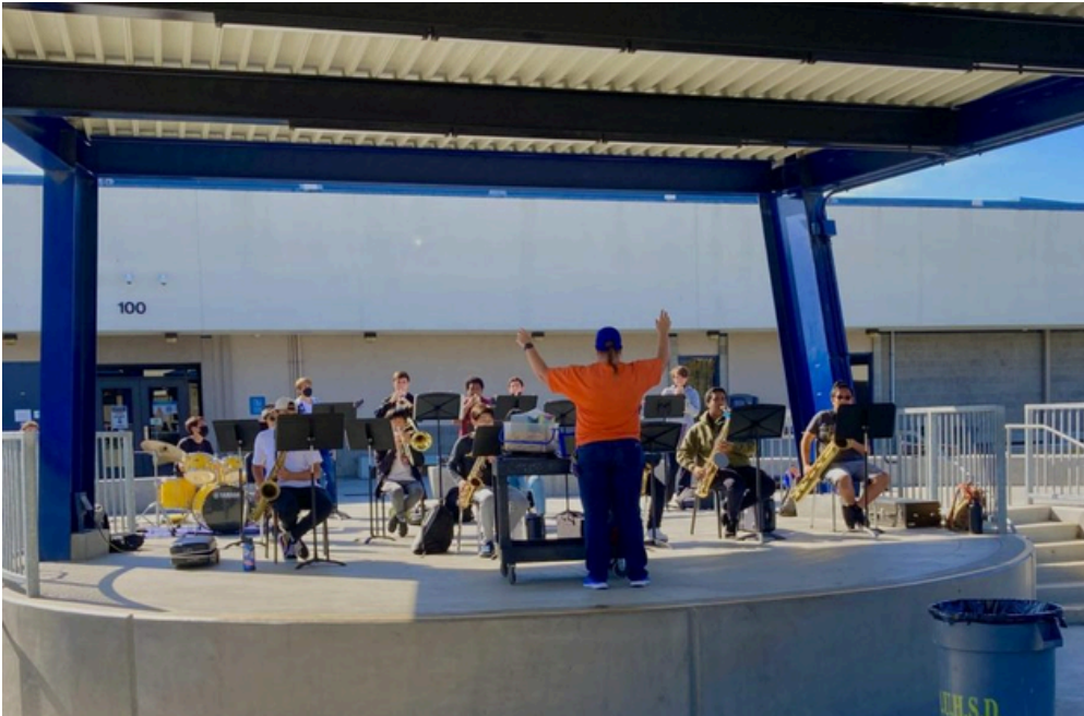
Every Monday, Wednesday, and Friday, Jazz Band practices their sound in the quad.

Cypress High School, home to a variety of extracurriculars, features Jazz Band, a group of students who meet up to make jazz music.