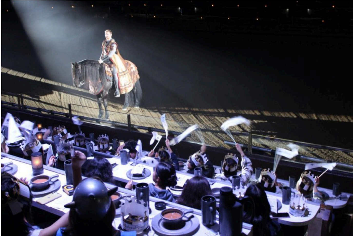
Students cheer on our school's knight during the thrilling show at Medieval Times.