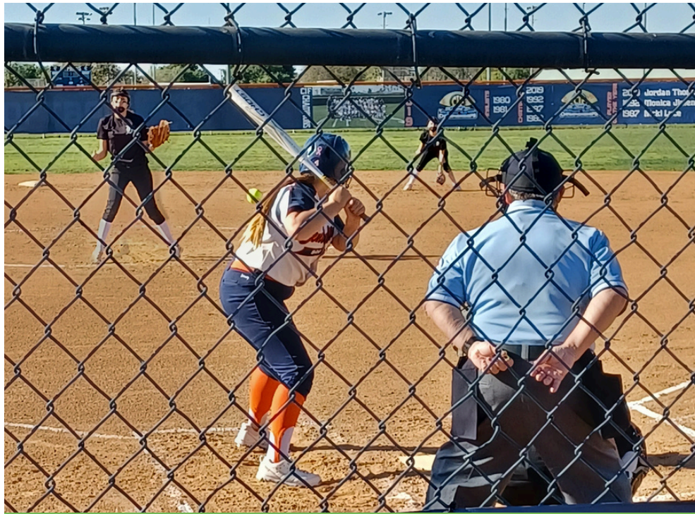
Softball is practicing for an up coming game