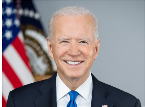
Biden's first year has been bittersweet.

Biden failed to win Senate approval for his $1.75 trillion Build Back Better economic plan. Not only was this a huge loss for his approval ratings, but also hurt millions of Americans.