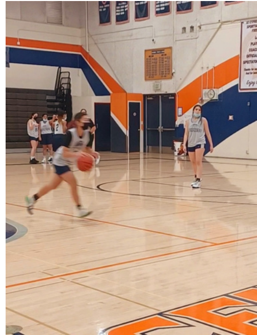
Girls Basketball practicing for a up coming game