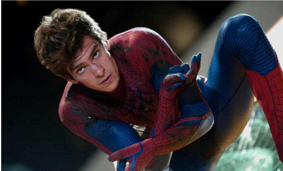
Andrew Garfield poses as Spider Man for The Amazing Spider-Man.

After his appearance in “Spider-Man: No Way Home,” fans rallied support for Andrew Garfield’s “The Amazing Spider-Man” franchise to finish his story with one more film.