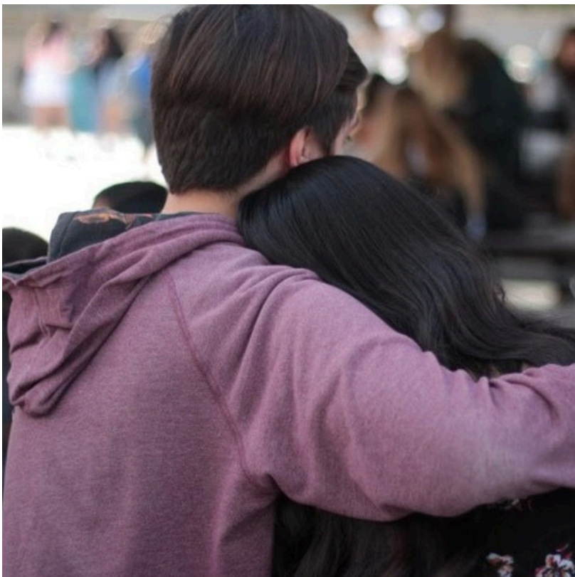
Couples show their love during Valentine's Day!