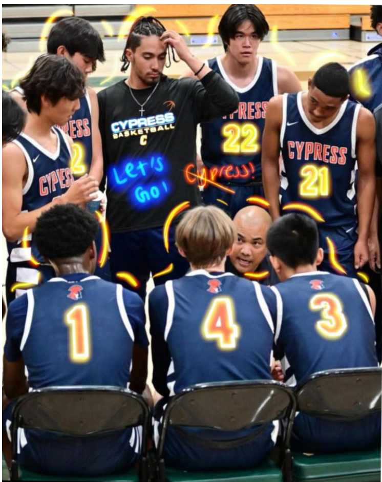
The boys discuss their next move during their break.

Boys' Basketball is getting ready to shoot, jump, and defend on the Centurion courts. Right now the team is 1-2 in the preseason with their rank at Varsity, JV, and frosh/