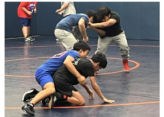
Wrestling is one sport that is a good activity to join and make some friends.