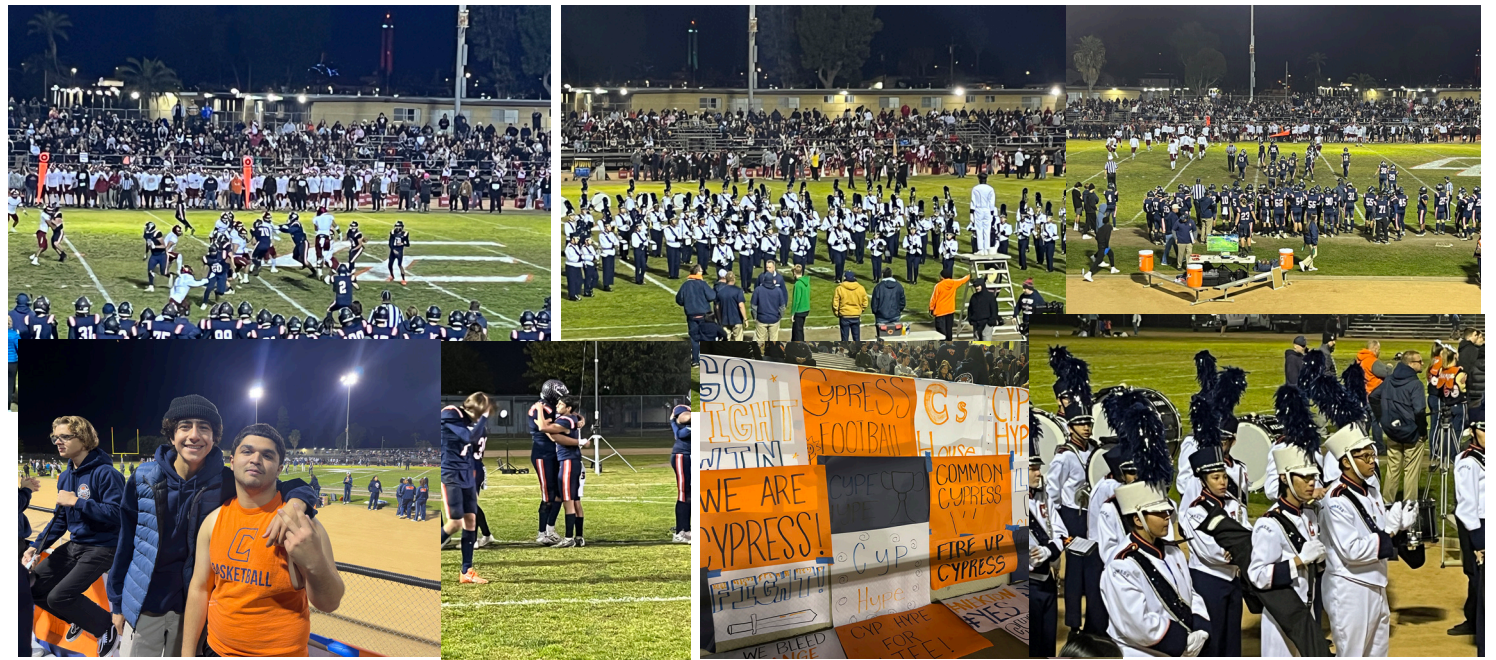
CHS was in the Championship game after appearances in 2007 and 2019 as well. We are 40-5 in our last 45 games.