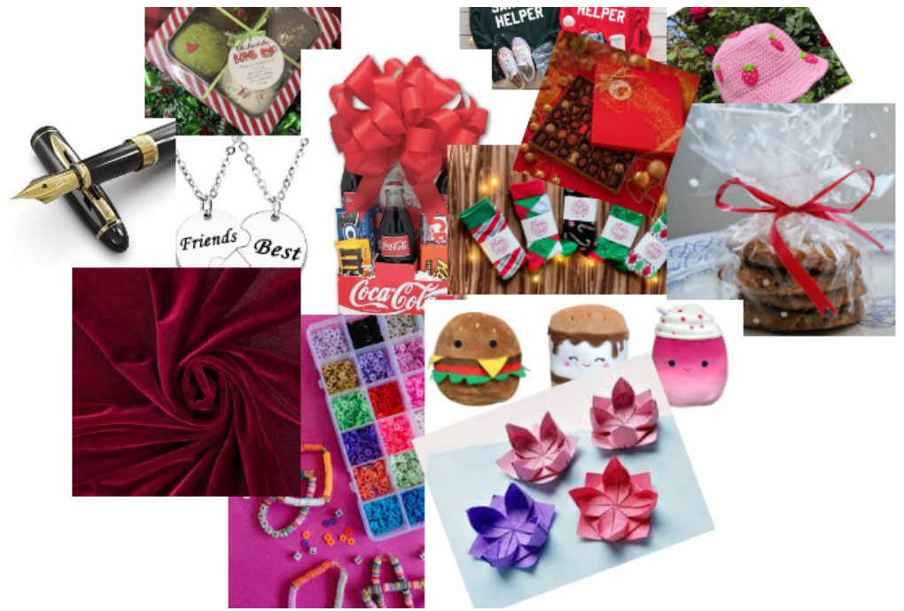
Gifts don't have to be extravagant! Here's a collage of some thoughtful Christmas gifts to give.