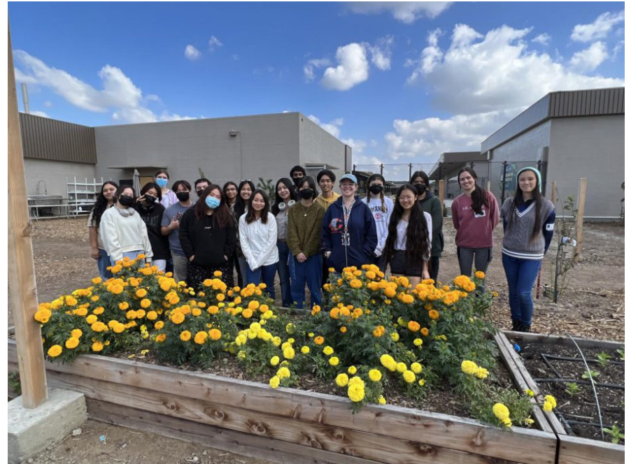
AP Environmental Science Students at the Magnolia Agriscience Community Center.