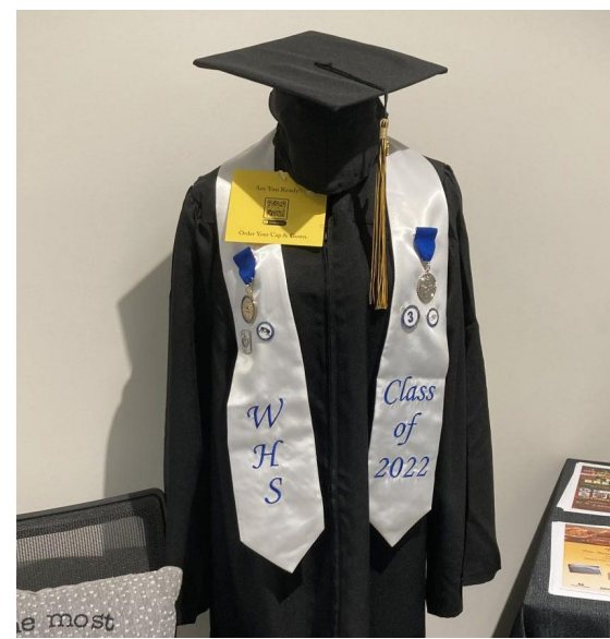
Western High School was the first to implement the regalia change, and now other schools in the district are following suit.