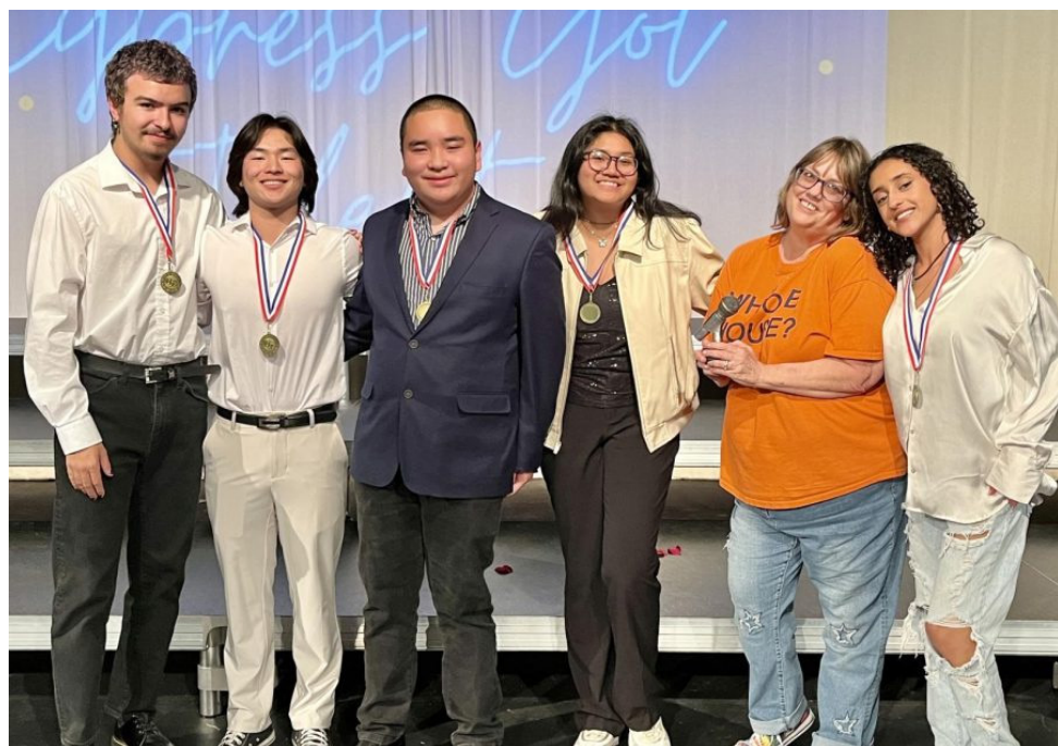
Award winners of Cypress Got Talent included students and faculty, singers, comedians, and dancers.

Cypress High School ASB hosted Cypress Got Talent on December 7, 2022, to give Cypress students and faculty a chance to showcase their diverse talents.