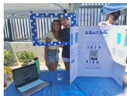
Club rush helped students find groups to join.