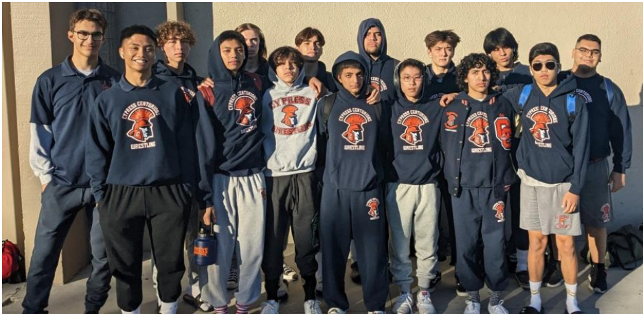
The Cypress Boy's Wrestling Team is ready for the Mann Classic.

Winter has arrived, which means the boy's wrestling team's season is also starting. Even though the season has just begun, the team has been conditioning and working out since the summer. The team is working on new moves while solidifying old ones.