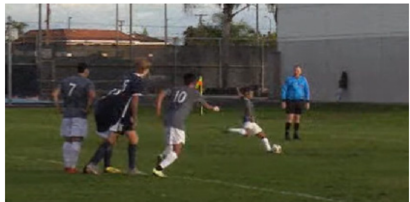
Boy's Varsity Soccer is off to a slow start.