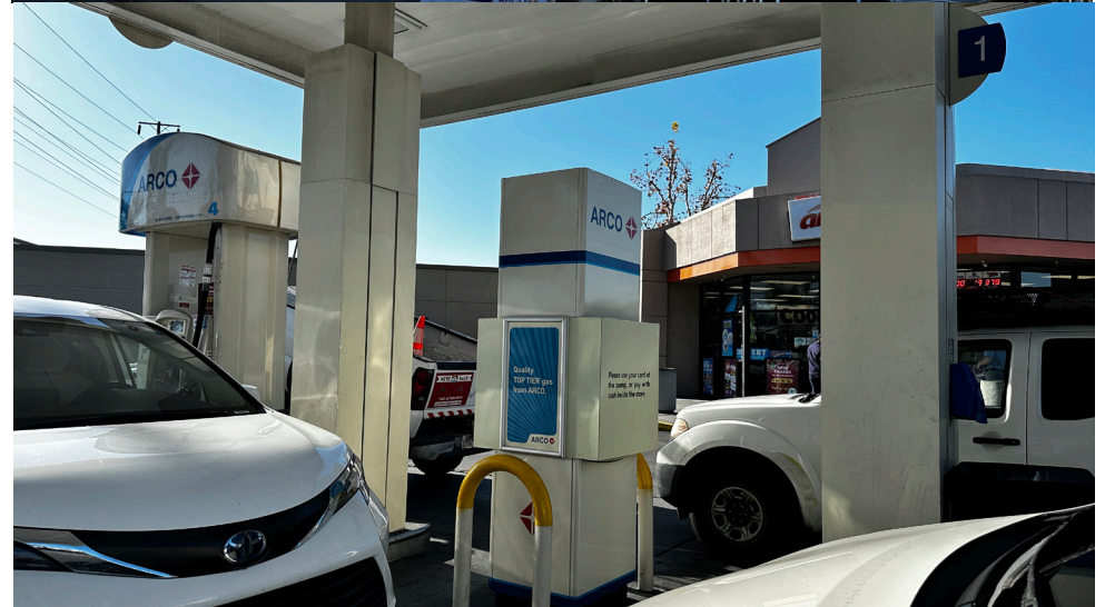
The gas station, Arco is the most visited gas station next to Cypress High School and their gas prices are around $4.79.