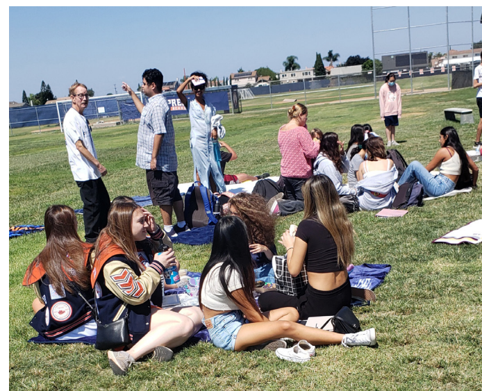
Best Buddies meets on the field on Thursdays.

Best Buddies's December 8th holiday party in the Media Center breathed some holiday spirit into an overworked Cypress High.