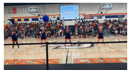
Cypress cheer bring joy and spirit to the students of Cypress.